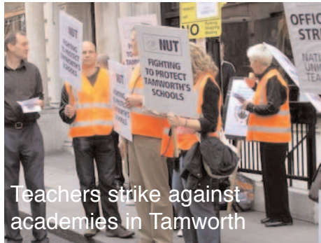
Teachers strike against academies in Tamworth

The amount of "bad behaviour" in the school hasn't really changed, it's just that now they try and pretend that there isn't any. So now, they make a