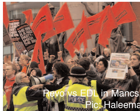
Revo vs EDL in Mance.

The final nail in the coffin for anti-fascists on Saturday was when